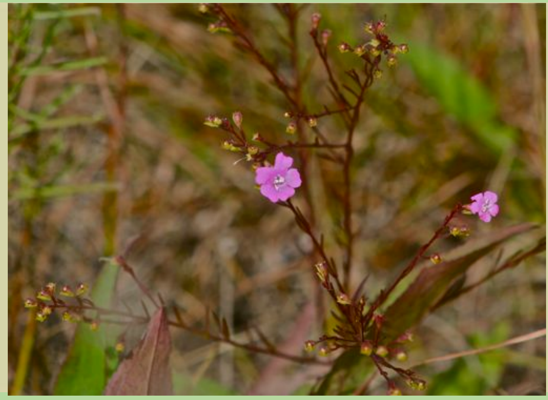
Agalinis acuta Blooming In The Sun In September