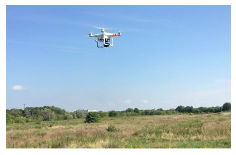
Drone in Take-Off and Oblique Air Photo Looking Toward The Northeast