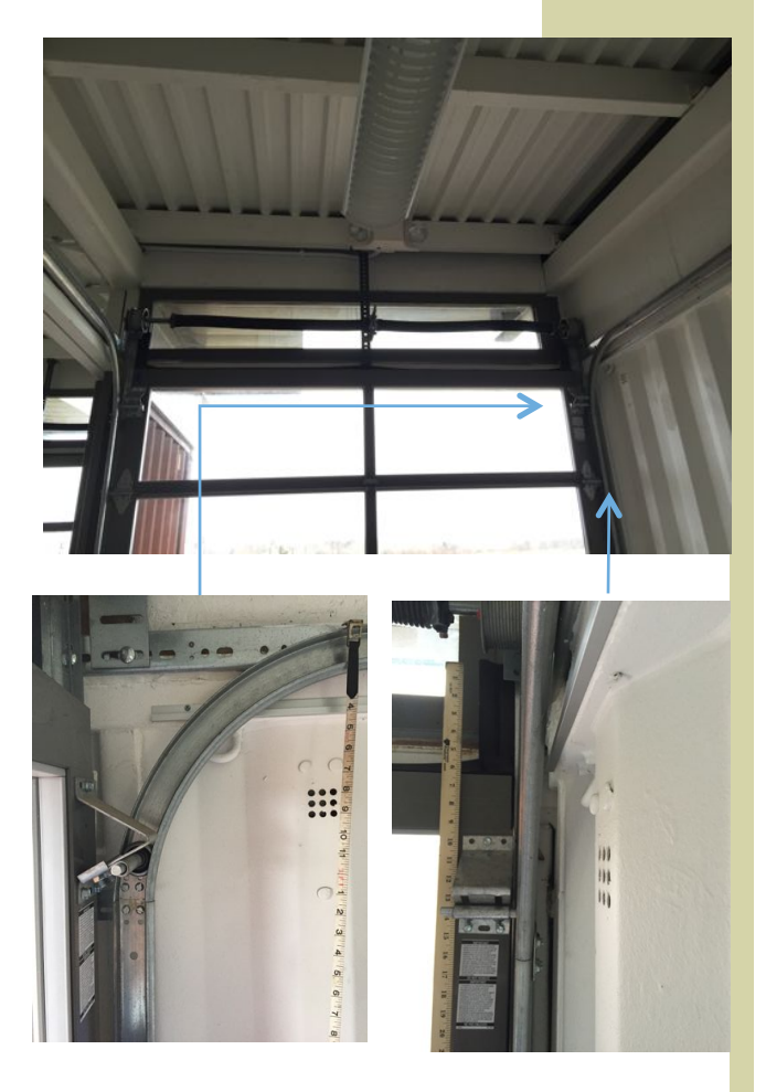
Views of Top of Door in Need of Light-Blocking Solution

Do we have any engineering students out there who would want to work with us to design and test a variety of solutions? Please contact info@friendsofhp.org.