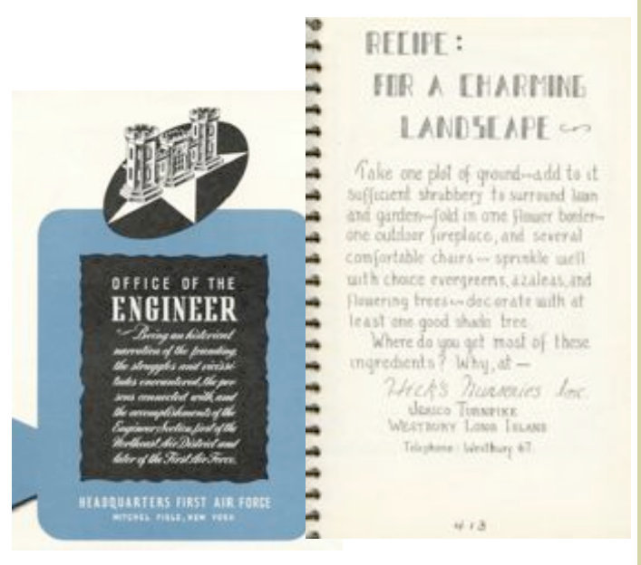
Image of the First Air Force Prologue and a Historic Ad for Hicks Nursery.

Please consider using these resources for fun and education, and if you have a story to share about trying out the recipes, or maybe you have a personal tie to the history of the plains, please contact us at info@friendsofhp.org.