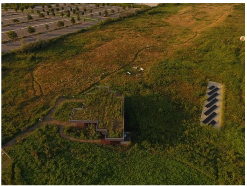
Oblique Aerial Photo Taken August 19<sup>th</sup>, 2017 Showing An Irrigated Green Roof, Solar Array, Outdoor Classroom and Old Mitchel Field Runway.

I am a bee Who lands on five pink petals Of globally rare Sand Plain Gerardia Whose flowers last less than a week I jam my head into its calyx A pink room of nectar I accidentally brush against pollen That clings to the hairs on my back I mate with the flower Of the Hempstead Plains